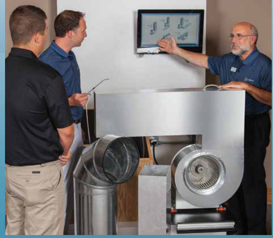
System Effect Demonstration

Electronically Commutated Motors and Controls