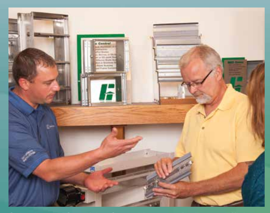
Selecting and Specifying Control Dampers for Energy Efficiency