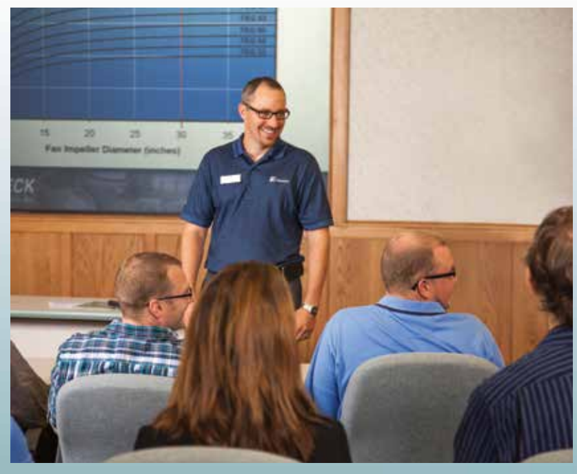
Selecting Efficient Fans and Fan Efficiency Grades